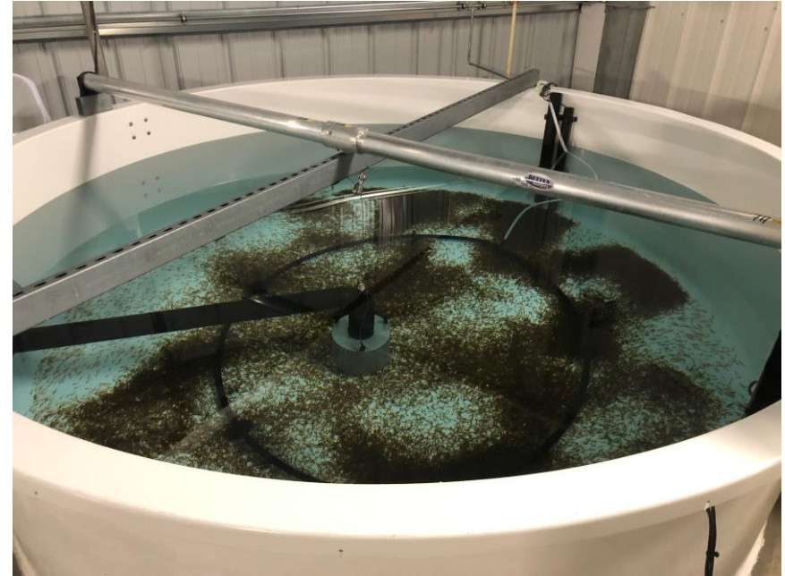
February 2019: First commercial batch swimming in Biscayne Aquifer water in the start feeding department